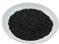
Black cumin seeds