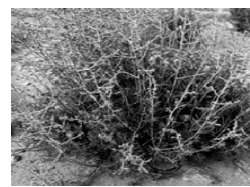
Artemisia sieberi plant

In the fourth quarter 2008 edition of Mineral Writes , we reported medicinal benefits of feeding black cumin seeds in layer diets as an alternative to antibiotics. That study concluded that black cumin seeds supplementation positively affected egg production, egg weights and eggshell quality while actually decreasing concentrations of cholesterol in the egg yolk. Questionable availability and cost effectiveness remained unanswered. Recently another study focused attention on the possible beneficial qualities of supplementing poultry diets with black cumin seeds . This time supplemented broiler diets were studied that examined possible influence on both performance and health in broilers.