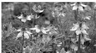
Black Cumin — Nigella sativa plant